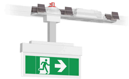
Figure shows accessory

ATTENTION! The specified protection class refers to the luminaire (room side) when installed. If installed in a gear tray with a different protection class, the lower protection class applies.