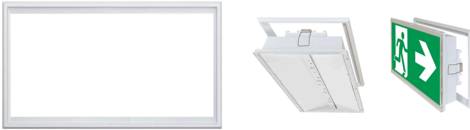
Luminaires are not included in the scope of delivery

For concrete construction you can use the universal installation housing from the company Kaiser (Kaiser item no.: 1297-34) for wall mounting, which you have to order separate at your preferred wholesales.