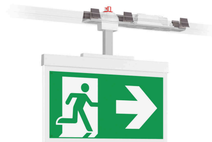
Figure shows accessory

ATTENTION! The specified protection class refers to the luminaire (room side) when installed. If installed in a gear tray with a different protection class, the lower protection class applies.